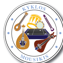
front cover of book

Who should purchase this publication? Music schools and students, church organizations, Greek music stores, individuals wishing to learn the history of Greek music, and the theories and methods of Hellenic and Near Eastern music.