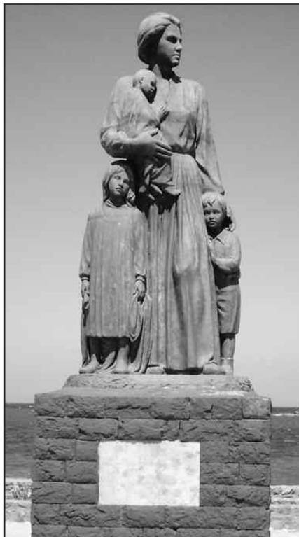
Statue of Mikrasiatiki Manna ("The Mother from Asia Minor") at Mytilene Harbor in Lesbos, Greece.

The Greek Government also has asked the United States to permit it to award the Medal of Military Merit to the commanding officers of the twelve American destroyers which assisted in the evacuation of the Greek refugees.